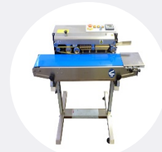
Option: Stainless Steel Stand (Horizontal Only)