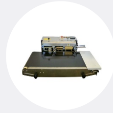
Option: Extra Wide Conveyor